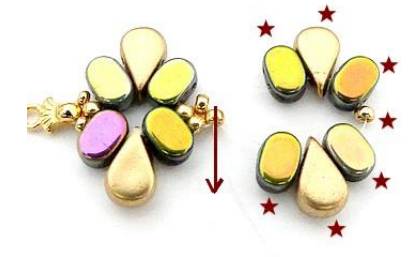
6) Exith through the central SB11. Pick up 1 Lipsi, 1 Amos, 1 Lipsi, 1 SB11. Then 1 Lipsi, 1 Amos and 1 Lipsi and exit HERE through the SB11