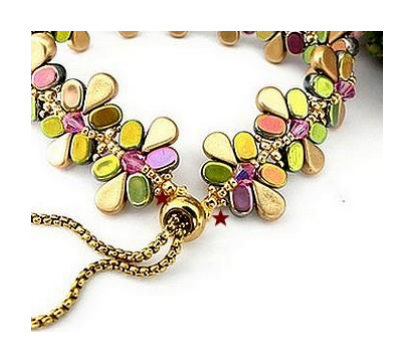
15) Place the clasp.Your bracelet is finished