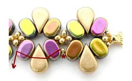
11) Pick up 1 SB15 and exit HERE.