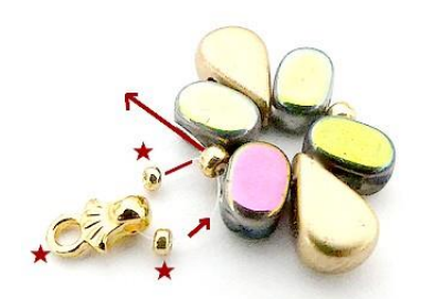
3) Pick up 1 SB15, 1 Pilos or ring, 1 SB15 through the same SB11. Reinforce