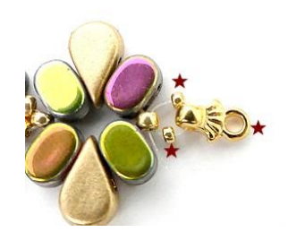
9) At the end, pick up 1 ring or Cymbal through the same SB15, 1 SB15 and reinforce