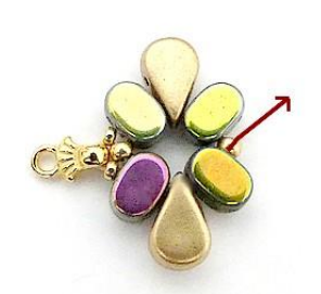
4) Here the result Exith through the SB11 HERE