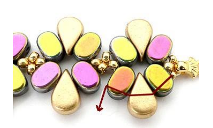
10) Exith HERE 😊