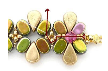
14) Reinforce by returning from SB11 in photo 12. Exith HERE through the SB11 of the next element.