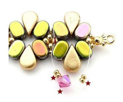
13) Pick up 2 SB15, 1 B4, 2 SB15 through the SB11 HERE