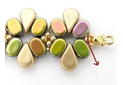
12) Here the result SExith through the SB11 HERE